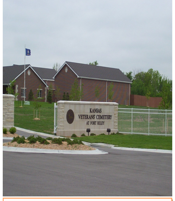
Kansas Veterans' Cemetery at Fort Riley