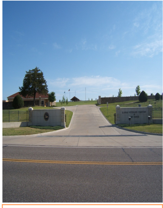
Kansas Veterans' Cemetery at Fort Dodge