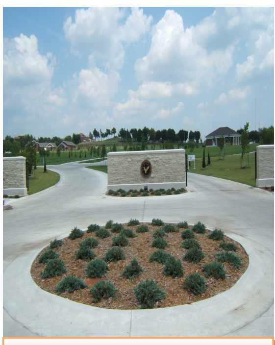
Kansas Veterans' Cemetery at Winfield