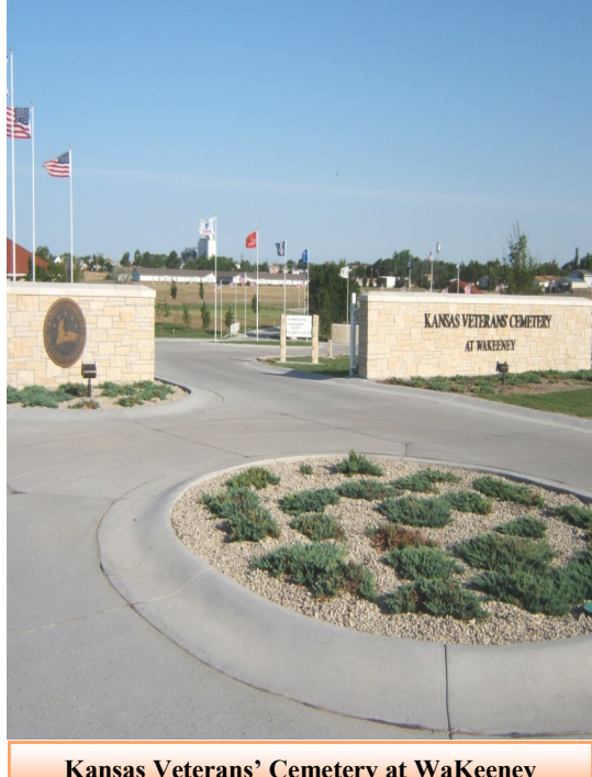
Kansas Veterans' Cemetery at WaKeeney