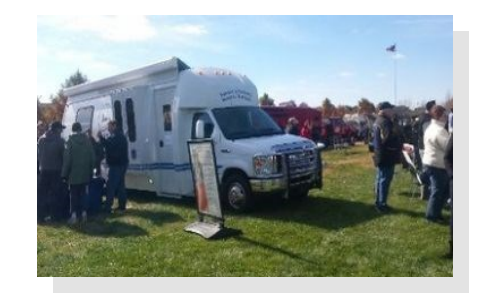
The Emporia Mobile Office at the Sprint Campus in Overland Park